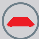
CONNECTABLE TO PLATFORM UP TO 4 LOAD CELLS