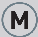
METROLOGICAL VERIFICATION OPTIONAL (UE)